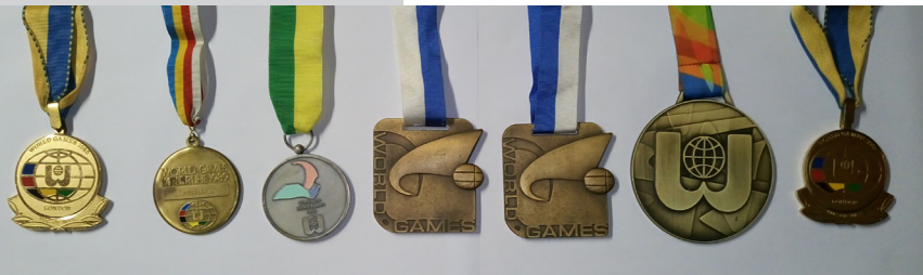
Medals from the World Games.