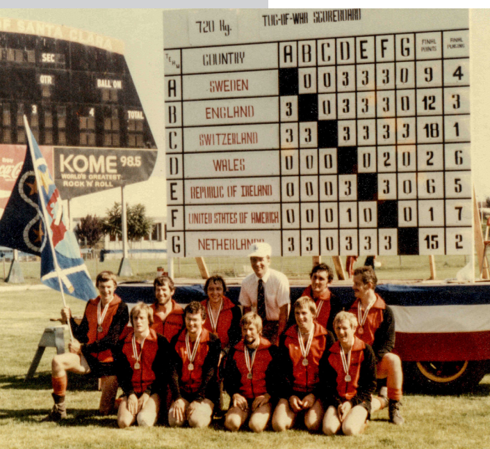
Scoreboard in Santa Clara.

Since 1981 with the start of the World Games in Santa Clara, the others were in London (GBR) in 1985, Karlsruhe (GER) in 1989, The Hague (NETH) in 1993, Lathi (FIN) 1997, Akita (JAP) 2001, Duisburg (GER) 2005, Kaohsiung (TPE) 2009 and Cali (COL) 2013. Now our teams are preparing for the next edition in Wroclaw (POL).