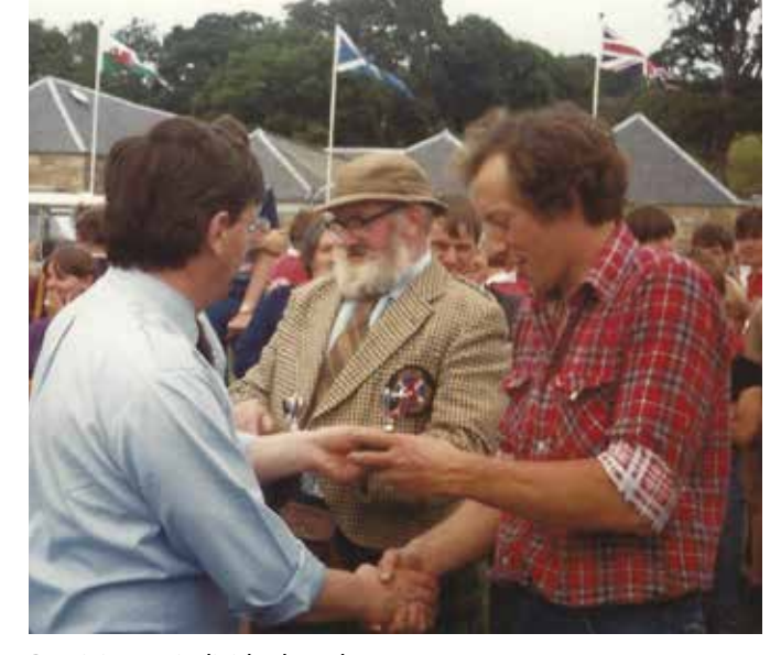
Receiving an individual trophy 1982.

The Scottish Championships was held two weeks later at Doune Motor Museum and the team entered the 600, 640 and 680 kg and battled without success in the 600 and 680 but won silver in the 640 kg which enabled us to