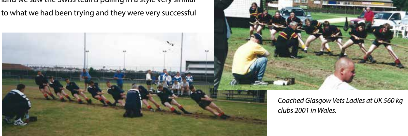
Above, coached Scotland 600 kg at UK's and below, coached Kinneff at Nationals at Cupar Highland Games.

so coaching became a lot easier on our return. The pullers had seen what we were trying to achieve even if it was an unsuccessful Championships the experience was invaluable for our development.