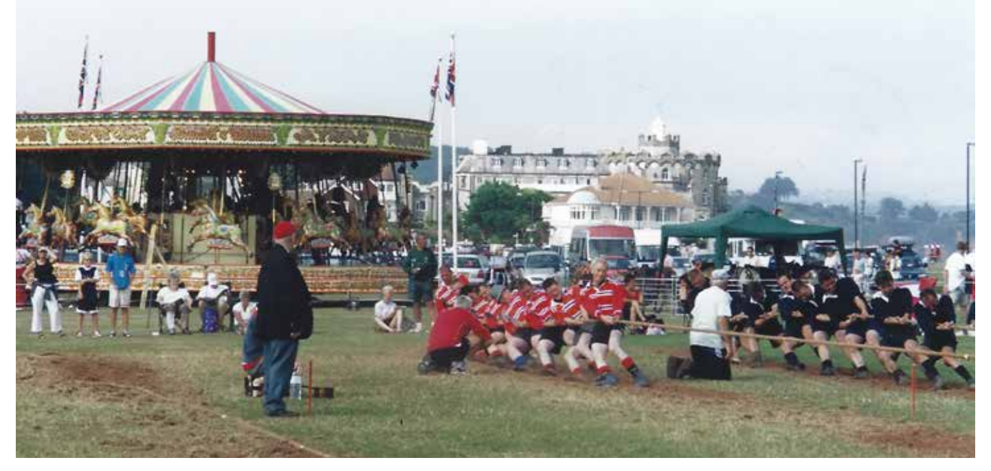
Frontman for Kinneff 600 kg at UK clubs Paignton, Devon.

Kinneff continued to develop and started indoor in the 80's initially for fitness for the outdoor season but it was proving hard to get the team to pull straight with all the local experts reckoning we had it all wrong in spite of being quite competitive for a young farmers team on the local circuit. All that changed in 1992 when we competed at our first Worlds representing Scotland in the 560 kg in Ireland we saw the Swiss teams pulling in a style very similar to what we had been trying and they were very successful