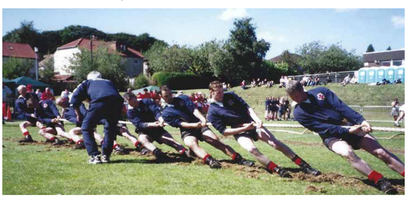
Anchored Scotland 600 kg at UK's Bearsden, Glasgow.

We won very few ends but managed to beat Callander, had a great experience and a long journey had begun. We had a lively bus journey home on Saturday night with little or no sleep and probably no one could have passed a drugs test. We rounded up a few reserves to fill the blanks and held 80 miles north to win the 640 kg Scottish tradional style by beating a great team from Bonnar Bridge in the final - either a totally unforgettable weekend or a complete blank.