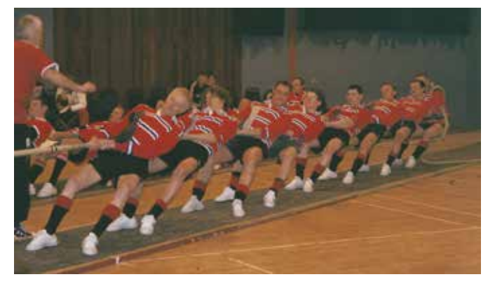
Pulling at 1 for Kinneff at Clonmany, Ireland.

Kinneff continued to represent Scotland internationally picking up odd medals at the UK club competitions but always inviting good pullers from other clubs like Strathbogie, Balmedie, Comhill, Durris, Turriff, Mount Blair and many others to improve our team and give more athletes the experience of high level pulling and take it back to their own clubs. In 1996 Kinneff was struggling to put teams out and I was invited to coach Kinloch Ladies from Carnoustie at the worlds in Holland having won with them at the national championships. Although this trip did not result in any medals it was very important because I was asked to a meeting of all the ladies coaches to discuss mixed pulling. On my return Scotland started mixed pulling the following summer but at lighter weights than TWIF so that the ladies had a much greater influence on the results and this event has proved to be very popular in Scotland.