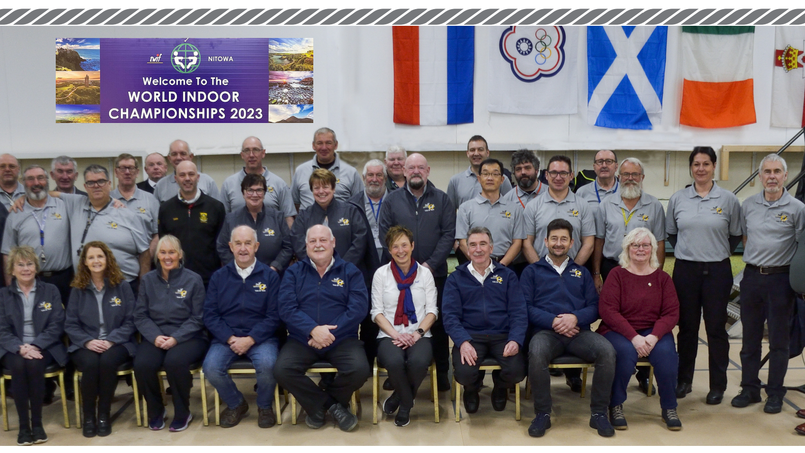
Judges and recorders at the 2023 World Indoor Championship in Belfast .

With a very successful 2023 World Indoor Championship in Belfast, Northern Ireland, behind us, we are looking forward to the 2023 Seminar and Congress in Mannheim, Germany.