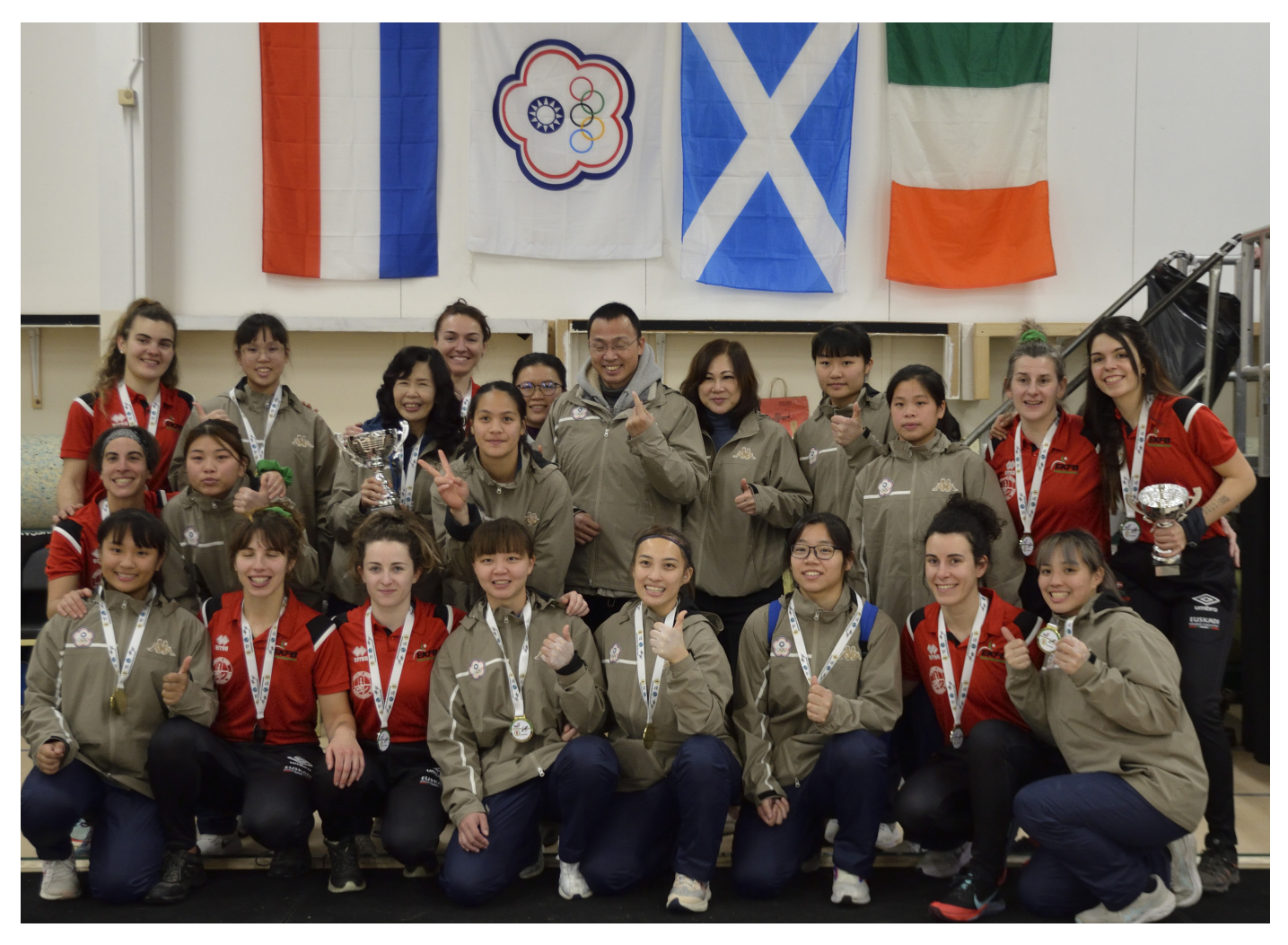
Chinese Tapei & Basque Country teams at the 2023 World Indoor Championship in Belfast.