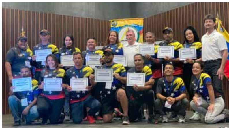
Certificates were handed out to the participants in a ceremony.